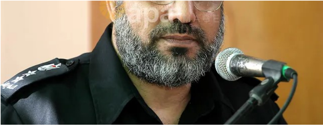
Yousef al-Zahar [Source: apaimages.info ]

According to statistics from the Palestinian Authority Ministry of Health and the PRCS, from the outbreak of the second Intifada in September 2000 to when I wrote the 2010 article, Israeli Forces have killed at least 56 medical rescuers, including paramedics, drivers, doctors and volunteers—an average of one rescuer every two months—and have injured at least another 500 medical rescuers.