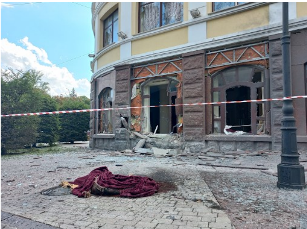
Ukraine's bombing of central Donetsk on August 4 targeted a hotel the author was in, killing a woman outside and five others nearby.

This is something I witnessed for myself when, on August 4, Ukraine bombed the hotel in which I was staying, the fourth and fifth shells landing 50 meters away and then directly beside the hotel, respectively. When the fifth struck, shattering inwards the lobby glass doors, I had fortunately just stepped out of the lobby where 30 seconds earlier I had been speaking to journalists who had run in from the street.