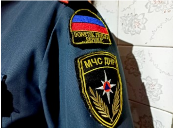
Donetsk Emergency Services crest.