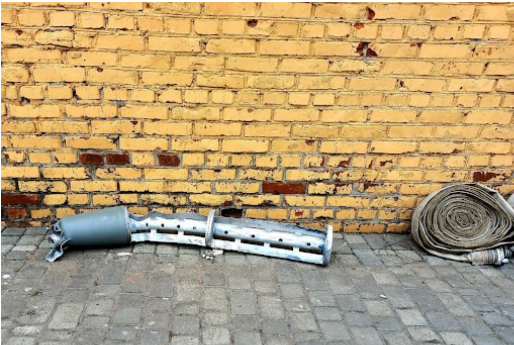
Remnants of a Ukrainian-fired "Hurricane" MLRS missile on the grounds of a Donetsk Emergency Services station in a civilian area.

Local residents describe the perpetrators of these crimes—who have received lavish U.S. funding—as “shameless,” “scumbags” and “terrorists.”