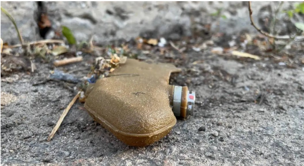
Petal mine on street in Donetsk.

I asked about the impact of the “Petal” mines Ukraine has been dropping on the city, and was told a 21-year-old employee was injured by a PFM-1S mine after a region was cleared, the mine falling from the building and the unsuspecting rescuer stepping on it, losing his foot.