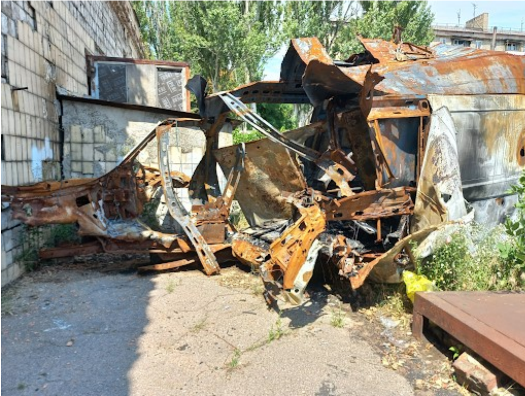
Donetsk ambulance destroyed by Ukrainian shelling while out on a call.

Donetsk, destroyed an ambulance and seriously injured the driver.